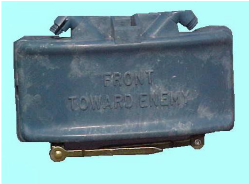
M33 Practice Weapon Body Weight—1.6 KG 22 x 14 x 6 cm Color = Medium Blue