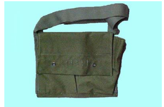
M7 Bandoleer Carrying case for M33, M57, M10, & M40. Includes shoulder strap and instructions. Weight--.1kg, 12 x 25 x 30 cm