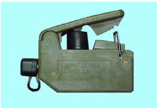
M57 Firing Device – Hand operated detonator. Generates electrical impulse to activate M10 & M40. Does not need a battery. Weight - .4 KG : 3 x 9 x 12 cm

Final Packing: The M68 is packed with 6 units in a carton.