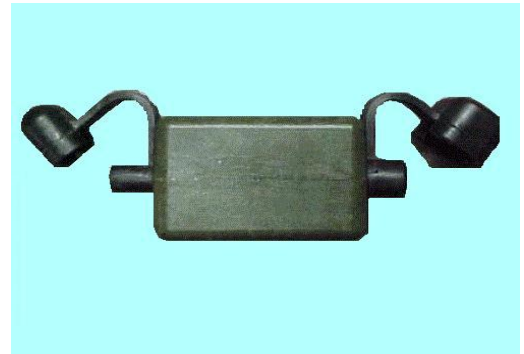
M40- Electrical Test Set Provides electrical circuit check of M57, & M4. Weight--.1 KG, 4 x 4 x 9 cm