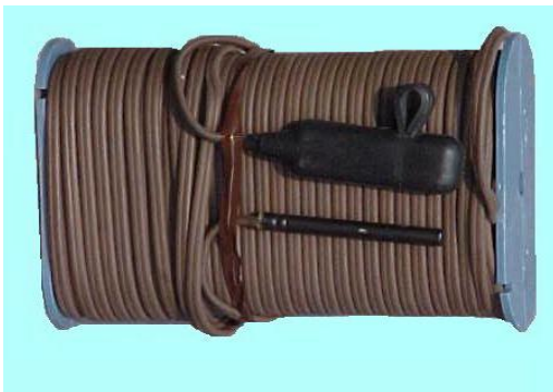
M10 – Practice Blasting Cap 33 meter electrical cable and with electrical continuity to provide electrical simulation with M57 & M40. Weight --.9KG, 5 x 11 x 15 cm