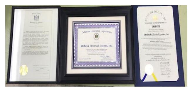
(Mohawk's original certificate, 30 year award and tribute from the House of Representatives)

The Delaware Workplace Safety Program was implemented in 1988 for companies to enroll in discounted savings for their businesses worker's compensation insurance. Mohawk Electrical Systems, Inc. was the first company in the state to participate. Over the last five years, Delaware employers have saved over 45-million dollars in insurance premiums and participating employers saved up to 19 percent annually on their Delaware portions.